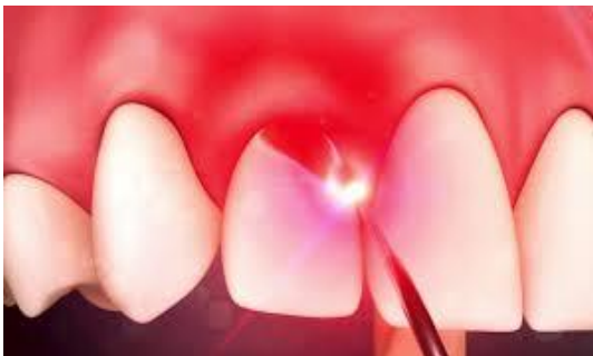
Figure 2. Gingivectomy with soft laser

We included eight papers in this review. The age range of the patients was 10 to 32. The table provides an overview of the clinical studies that were part of this investigation. Two studies reported labial frenectomy, while four research employed lasers for gingivectomy ( Figures 2 and 3 ). Two publications looked into lingual frenectomy. Seifi et al. and Ize-Iyamu et al. performed surgical exposure of delayed tooth eruption. A study that contrasted the use of a laser with a traditional scalpel approach for fibrotomy found that the use of a laser in conjunction with fibrotomy effectively reduced rotational relapse. One patient had laser operculectomy in a different research. Six investigations made use of diode lasers. When compared to a traditional surgical method, Junior et al. used a neodymium-doped yttrium aluminum garnet (Nd: YAG) laser for a labial frenectomy. Jahanbin et al. performed fibrotomy using an Er: YAG laser. In lingual frenectomy, Aras et al. examined the effectiveness of Er: YAG and diode lasers. While the majority of articles used diode lasers in their processes, there are variations in the features of irradiated diode lasers only in terms of wavelengths and laser input strength.